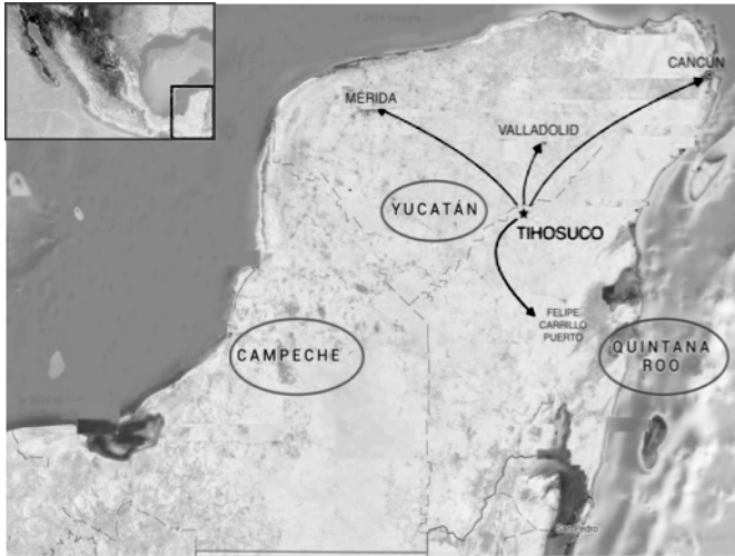
Figure 1. Tihosuco in scale to Mexico. 6

For example, Tihosuco, located in the western part of the state of Quintana Roo and near the border of the state of Yucatán, is accessible through a very well maintained road that connects it to Valladolid, in Yucatán, and Felipe Carrillo Puerto, Tihosuco's municipal center in Quintana Roo. Moreover, it is three hours away from Cancún, and almost three hours away from Merida, the largest city on the Yucatán Peninsula (see Figure 1). The well-maintained roads, as well as the closeness to Cancún, have allowed grand resorts to pick up workers in Tihosuco early in the morning, bring them to the hotels to provide services as launderers, kitchen staff, and general maintenance, among others, and take them back to Tihosuco at night. Economic remittances, construction ideas, and linguistic ideologies, such as the importance of English, are some of the forms of capital that are transported in these three-hour daily trips (Fieldnotes, July, 2016).