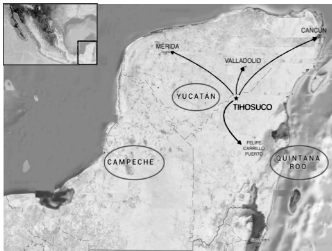
Figure 1. Tihosuco in scale to Mexico. 6

For example, Tihosuco, located in the western part of the state of Quintana Roo and near the border of the state of Yucatán, is accessible through a very well maintained road that connects it to Valladolid, in Yucatán, and Felipe Carrillo Puerto, Tihosuco's municipal center in Quintana Roo. Moreover, it is three hours away from Cancún, and almost three hours away from Merida, the largest city on the Yucatán Peninsula (see Figure 1). The well-maintained roads, as well as the closeness to Cancún, have allowed grand resorts to pick up workers in Tihosuco early in the morning, bring them to the hotels to provide services as launderers, kitchen staff, and general maintenance, among others, and take them back to Tihosuco at night. Economic remittances, construction ideas, and linguistic ideologies, such as the importance of English, are some of the forms of capital that are transported in these three-hour daily trips (Fieldnotes, July, 2016).